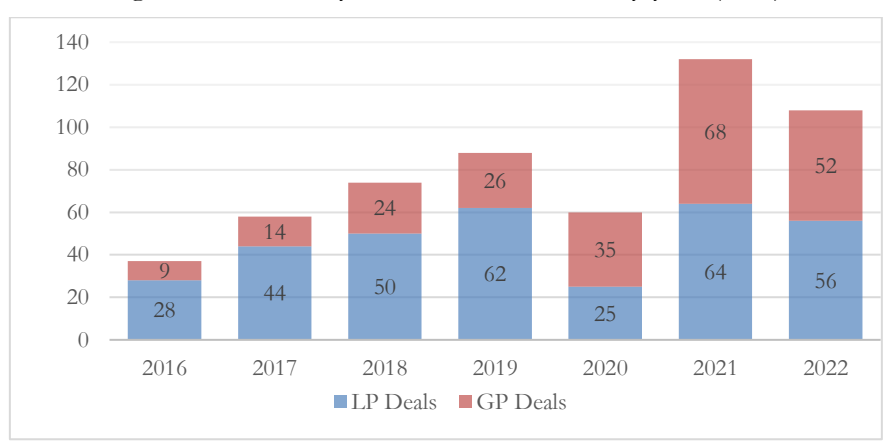
Figure 2: Secondary Transaction volume by year ($ bn)<sup>98</sup>

market volume, now account for approximately 50% of the overall volume of secondary deals, <sup>96</sup> sometimes outpacing LP-led deals. <sup>97</sup>