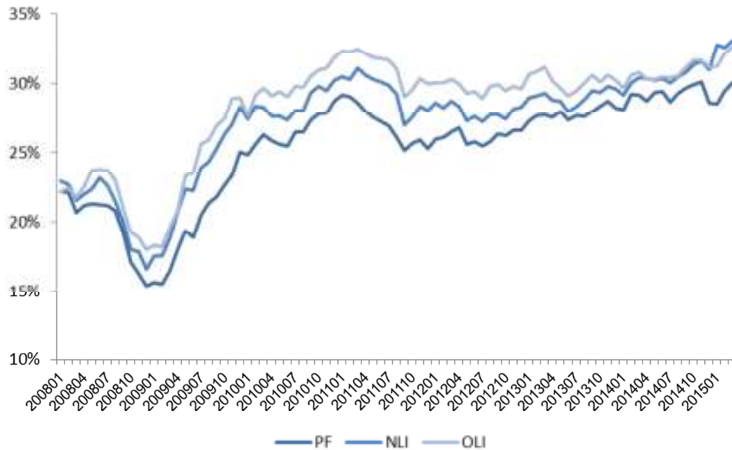
Panel B: Percent of Assets in “Alternative Investments”