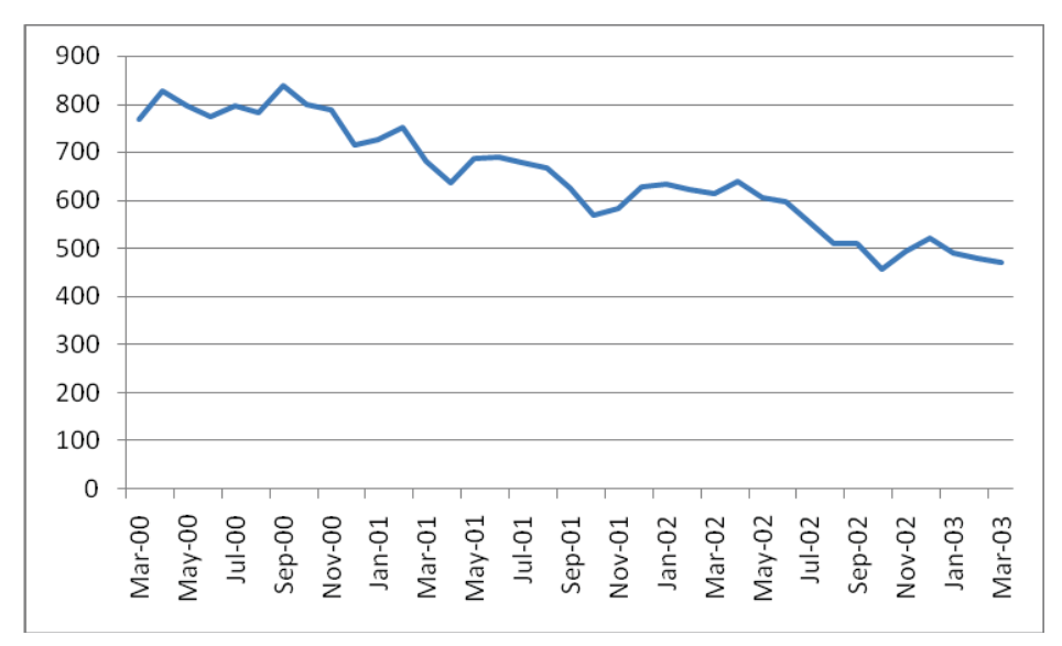
FIGURE 1: RUSSELL 3000 INDEX, MARCH 2000 - MARCH 2003 (BASED ON PRICES AT THE BEGINNING OF EACH MONTH)