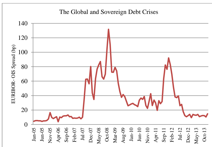
Figure 1: The Evolution of the Euribor-Ois Spread