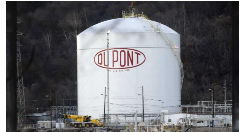
C-8 SAMPLING (MARCH - JUNE 1984)