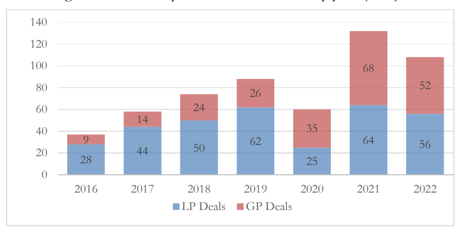
Figure 2: Secondary Transaction volume by year ($ bn)<sup>107</sup>

A continuation fund is only one type of secondary transaction conducted by GPs. Other types include tender offers, <sup>108</sup> portfolio strip sales, <sup>109</sup> and stapled transactions. <sup>110</sup> However, continuation funds are by far the most common type of GP-led secondary transaction. <sup>111</sup> In 2021 and 2022, continuation funds represented 83% and 85% of these transactions, respectively. <sup>112</sup> In addition, some continuation funds are beginning to be created earlier in a fund's lifecycle, <sup>113</sup> a practice that also raises some